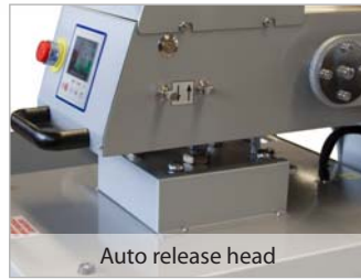
Auto release head