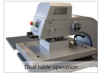
Dual table operation