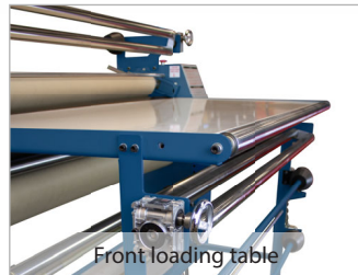
Front loading table