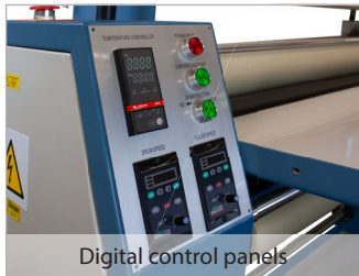
Digital control panels

Designed to perform with precision and speed