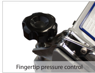
Fingertip pressure control