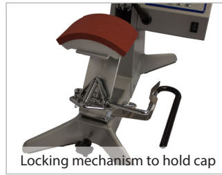
Locking mechanism to hold cap