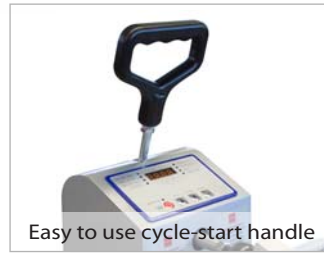
Easy to use cycle-start handle